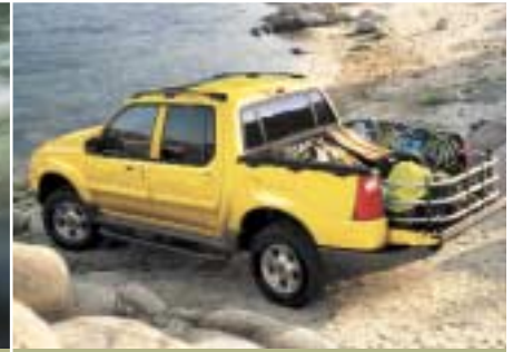
EXPLORER SPORT TRAC

The innovative 4-door Explorer Sport Trac combines the comfort and convenience of an SUV with the added utility of a flexible, open cargo area for “one vehicle does it all” versatility. Rugged, athletic styling shared with the Sport model makes Sport Trac the most versatile and active model in the Explorer lineup.