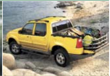
EXPLORER SPORT TRAC

The innovative 4-door Explorer Sport Trac combines the comfort and convenience of an SUV with the added utility of a flexible, open cargo area for “one vehicle does it all” versatility. Rugged, athletic styling shared with the Sport model makes Sport Trac the most versatile and active model in the Explorer lineup.