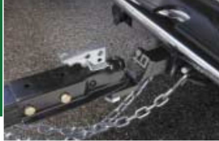
7-wire trailer wiring harness and frame-mounted hitch receiver (shown with aftermarket hitch equipment).